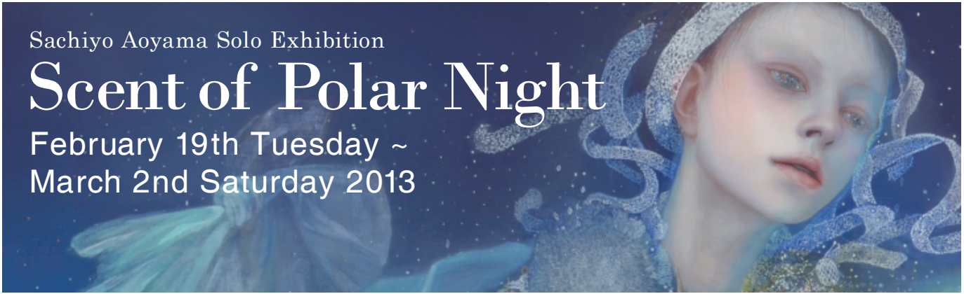
A tuner of the dream sounds (part of the work) 2012 1303×1202mm, oil, acrylic, and pen on canvas

February 19th Tuesday ~ March 2nd Saturday 2013