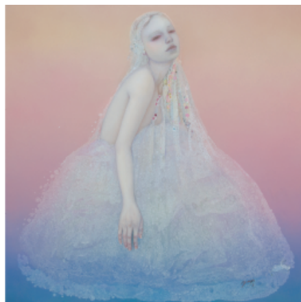
Scent of midnight sun 2013 910×910mm, oil, acrylic, and pen on canvas