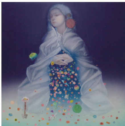
Scent of polar night 2013 910×910mm, oil, acrylic, and pen on canvas

Official website: http://sachiyo-aoyama.com/ Press kit: http://sachiyo-aoyama.com/document/20130116_exhibition.zip